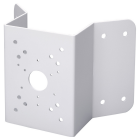
PFA151 Corner Mount