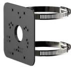
PFA152-E-B Pole Mount