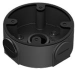
PFA13A-E-B Waterproof Junction Box