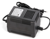
DC24V/2.5 A Power Supply