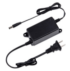
DH-PFM320D-US Power Adapter