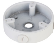
PFA137 Junction Box