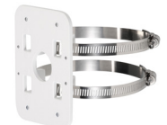
PFA152-E Pole Mount