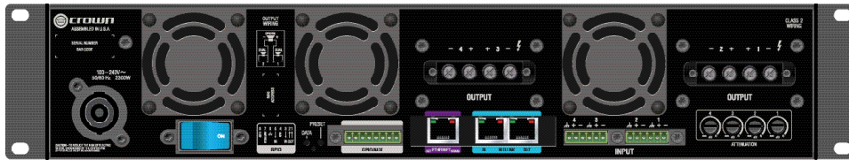
4|2400N model shown