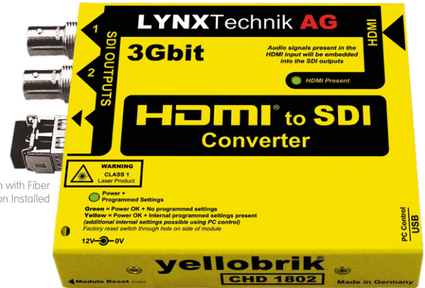
Shown with Fiber SFP Option Installed