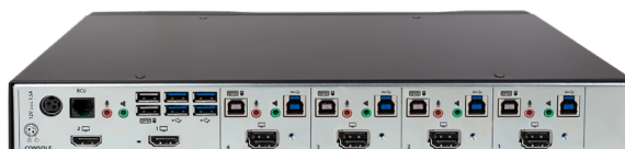
ADDERView CCS-MV 4224 - Rear