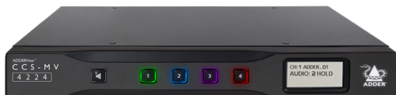
ADDERView CCS-MV 4224 - Front