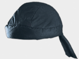
MIRACOOLO® TIE HAT