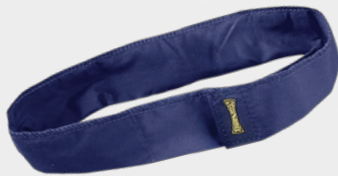
MIRACOOLO® COLLAR BANDANA