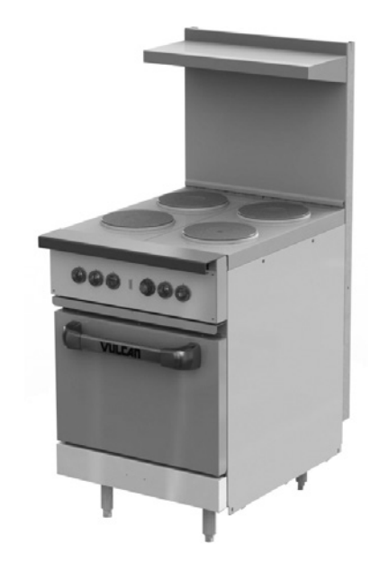
Model EV24S-4FP208 shown with adjustable legs