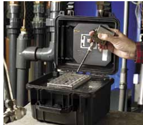
Now it's easy to work twice as fast.

Tip: While you're checking your transmitter sensor at one temperature, the other well can be heating or cooling to your next set-point.