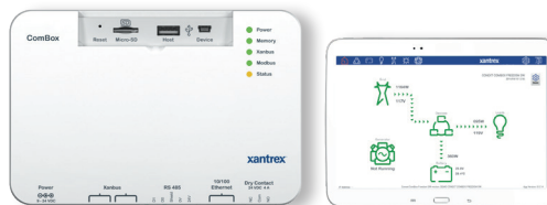
FREEDOM SW Conext Combox (809-0918)

Available telephone to network cable adapter to avoid the need to replace cables when replacing and old inverter. (#808-9010 sold separately)