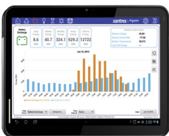
Conext ComBox Android mobile application