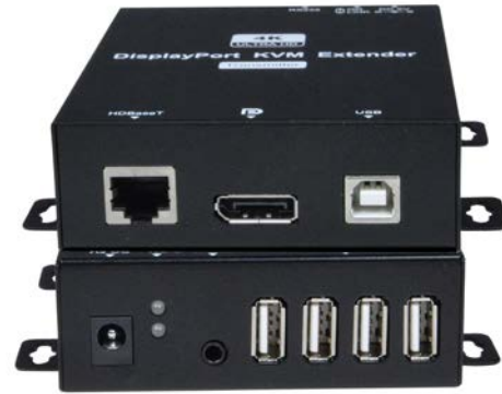
ST-C6USBDP4K-328 (Local & Remote Unit)