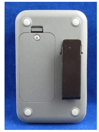
Dimensions – 4.25" L x 2.68" W x .91" D (note: belt clip adds .43" to depth)