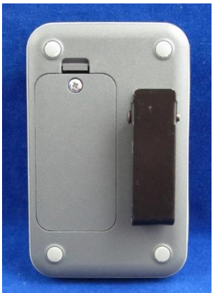
Dimensions – 4.25" L x 2.68" W x .91" D (note: belt clip adds .43" to depth)