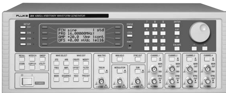
284 Waveform Generator

These universal waveform generators combine many generators in one instrument. Their extensive signal simulation capabilities include arbitrary waveforms, function generator, pulse/pulse train generator, sweep generator, trigger generator, tone generator, and amplitude modulation source.