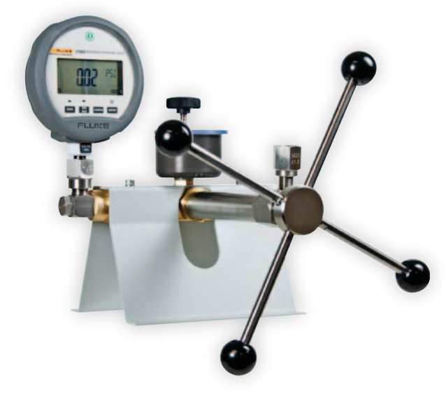
Combine the 2700G gauge with the P5510, P5513, P5514 (shown here) or P5515 Comparison Test Pumps for a complete bench top pressure calibration solution.

The 2700G Reference Pressure Gauges provide best-in-class measurement performance in a rugged, easy-to-use, economical package. Improved measurement accuracy allows it to be used for a wide variety of applications. It is ideal for calibrating pressure measurement devices such as pressure gauges, transmitters, transducers, and switches. In addition, it can be used as a check standard or to provide process measurements with data logging.