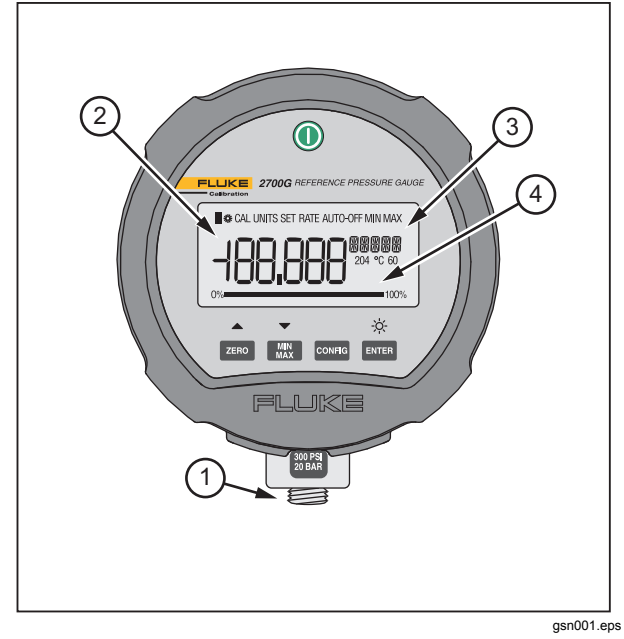
Figure 1. The Product

The Display and Buttons are shown in Figure 1. The Buttons are in Table 2.