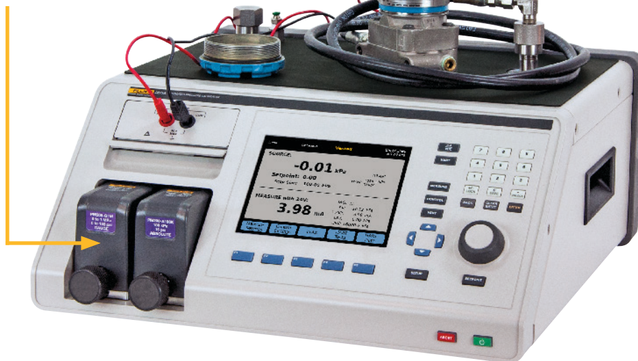
Use the 2271A to perform closed loop, fully automated calibration on 4-20 mA devices like this transmitter.

Install up to two pressure modules in the 2271A chassis at one time.