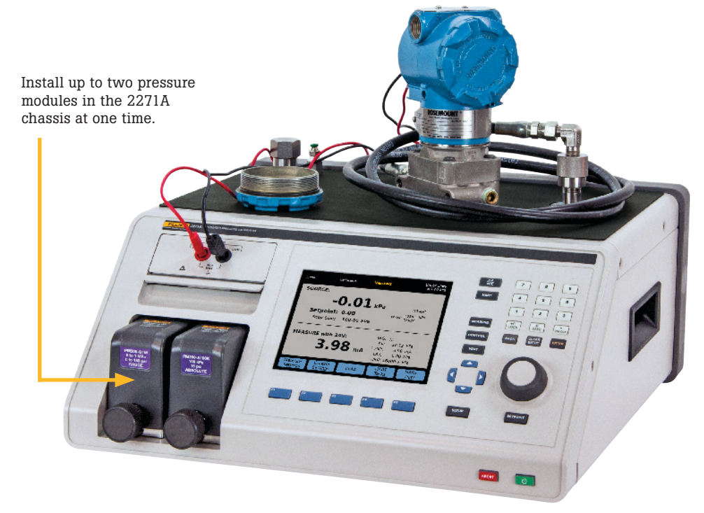
Use the 2271A to perform closed loop, fully automated calibration on 4-20 mA devices like this transmitter.

The 2271A accuracy specifications are provided in full and supported by a technical note that details its measurement uncertainty so you know exactly what you are getting. This technical note is available for download on the flukecal.com website. As with all Fluke Calibration instruments, these specifications are conservative, complete and dependable.