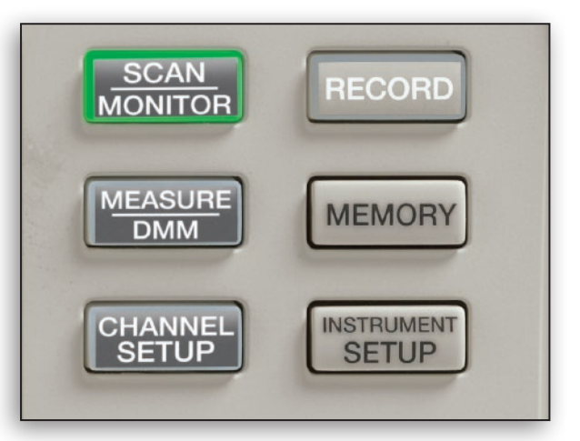
Scan, monitor, measure, and DMM function keys on the front panel.

Function keys are backlit so that you always know the mode of operation and recording status.