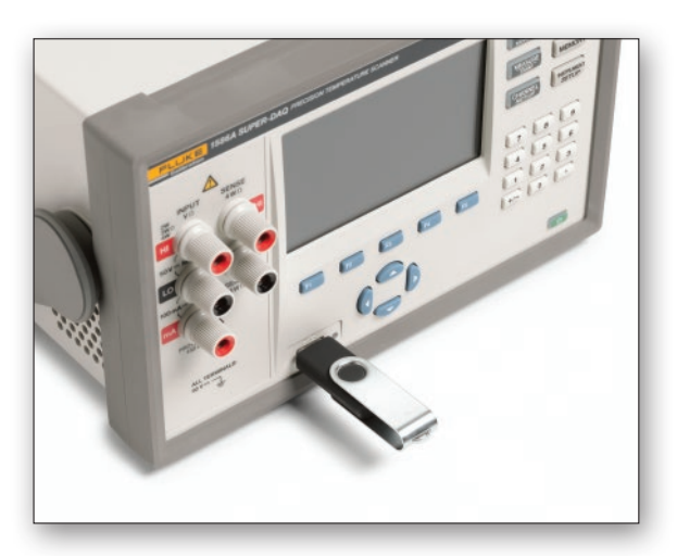
Easily transfer Super-DAQ data and setup files using a USB flash drive.

The Super-DAQ also includes two levels of data security to prevent unauthorized users from tampering with or forging test data or setup files. This security feature is especially important to industries that are regulated by government agencies where data traceability is required.