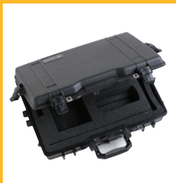
Probe and Readout Case