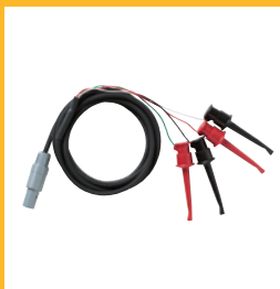
Universal RTD Adapter