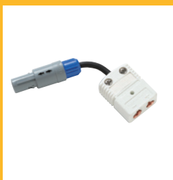
Universal Thermocouple Adapter