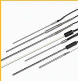
Calibrated Temperature Sensors

A wide array of accessories is available to help you maximize productivity, but the following are essential for most users.