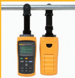
TPAK Magnetic Hanger