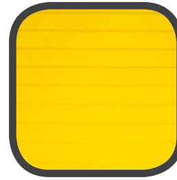
TOP OF CHOCK GRIPS FOR NON-SLIP OF THE TIRE.