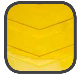
BOTTOM ON CHOCK "V" SHAPE FOR BETTER LEVELING ON UNEVEN SURFACES LIKE CONCRETE.