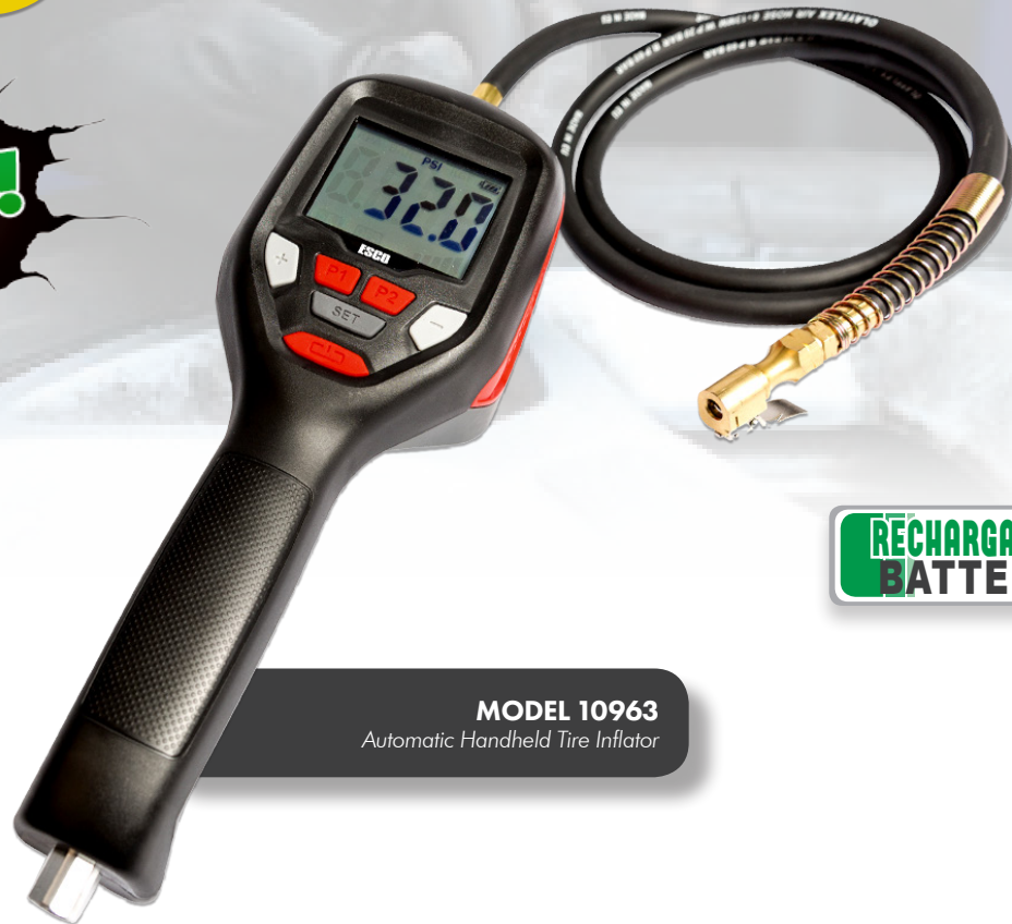
MODEL 10963 Automatic Handheld Tire Inflator