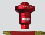
Air Reducer 110 psi -extends life of pump