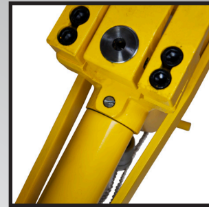
Adjustable redesigned sequence valve screw.