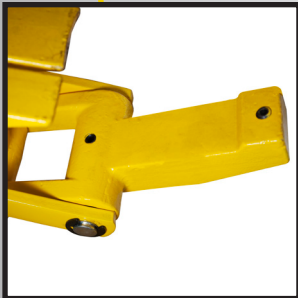
Redesigned replaceable extended jaw for deep dished style wheels.