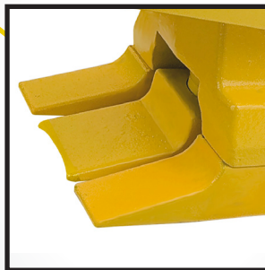
Redesigned replaceable teeth 1.25" longer than Model #10101.