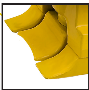
Redesigned replaceable pushing foot.