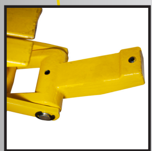
Redesigned replaceable clamping jaw.