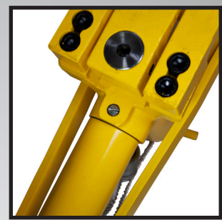
Adjustable redesigned sequence valve screw.